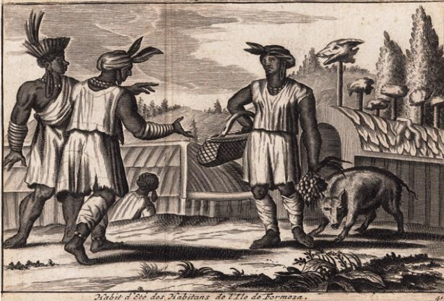
Olfert Dapper, Formosan inhabitants , 1670