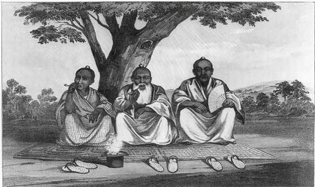
Perry Expedition, Lew Chew, c. 1856.

Handed to Satsuma after 1609. Sugar plantations, forced labour. The silk traditions you will see the day after tomorrow survived despite it all.