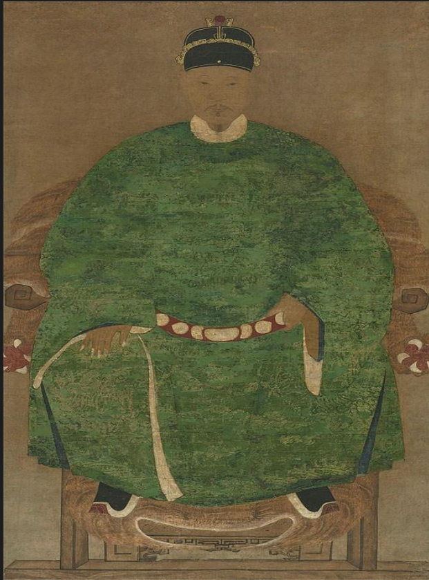
The pirate-merchant continuum from Lecture 1 — writ large.

Thirty-seven at victory. Dead within five months. He never saw China again.