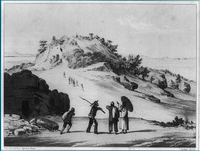
Nakagusuku Castle, Lew Chew, Perry Expedition, c. 1856.