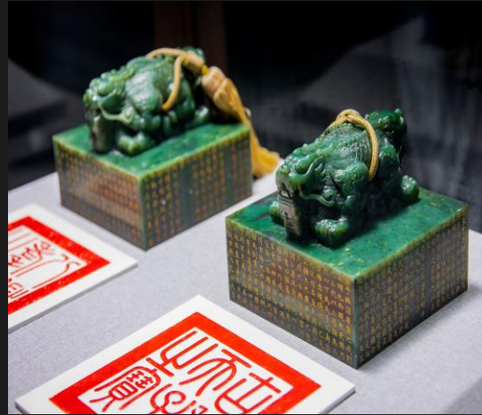
Imperial jade seals